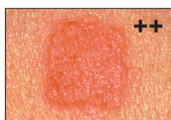
Strong positive Erythema, papules, infiltration, discrete vesicles