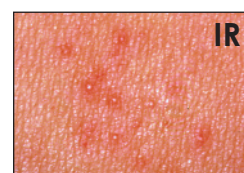
Irritant (IR) Discrete, patchy, follicular, or homogenous erythema with no infiltration