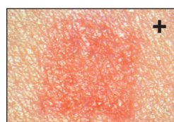
Weak positive Erythema, infiltration, discrete papules