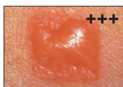
Extreme positive Coalescing vesicles, bullous reaction